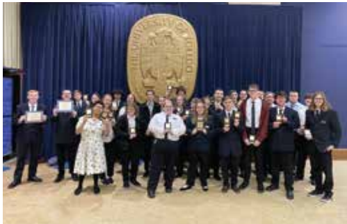
2020 BPA Regional contestants

Many Penta students on campus and through satellite programs participated in Career-Technical Student Organization (CTSO) competitions this past school year. Below are highlights about some of the contest winners.