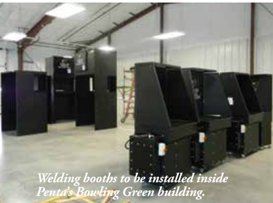
Welding booths to be installed inside Penta's Bowling Green building.

During the past several months, empty space in Penta Career Center's building at 760 West Newton Road in Bowling Green was converted into a lab for Welding, Forklift training and more for Adult Post-Secondary students. The work was done through a grant from JobsOhio. The new lab will have eight welding booths and offers flexibility to accommodate other types of adult training.