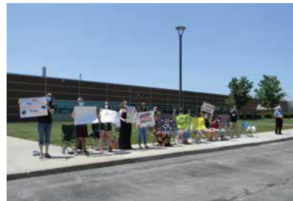
Instructors celebrated the Penta Class of 2020 as they drove through the parking lot.